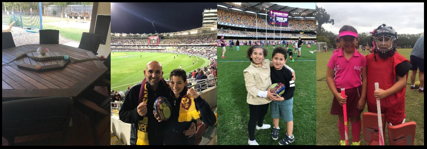
Looking for lunch