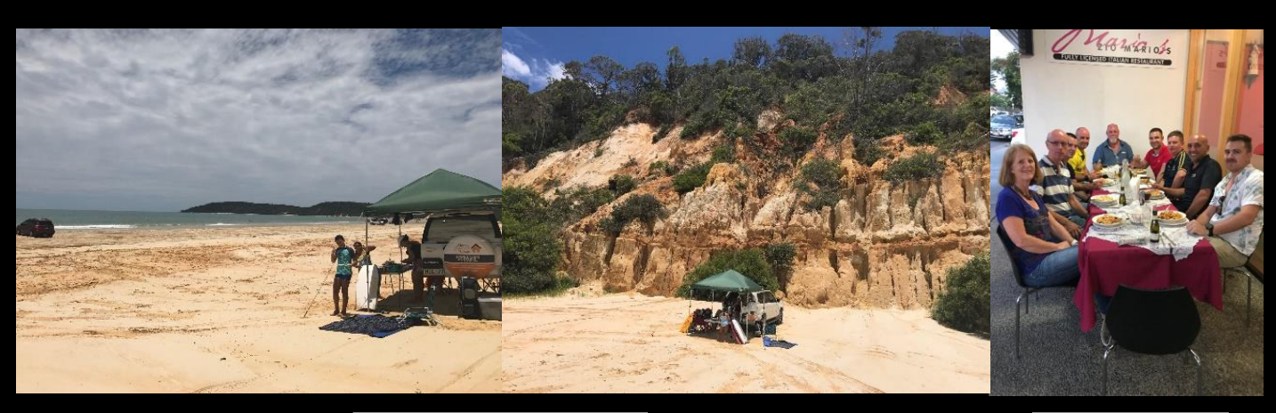
Never sick of coming back here